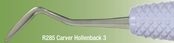
R285 Carver Hollenback 3