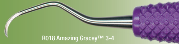
R018 Amazing Gracey™ 3-4