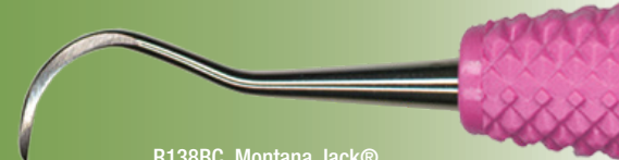
R138BC Montana Jack® Jack Goes Pink For The Cure

At PDT, we use high-quality USA 440A stainless steel to create harder and tougher instruments. Our attention to instrument blade size, angulation, curvature, and balance allow for superior anatomical adaptation leading to overall clinician comfort and efficiency.